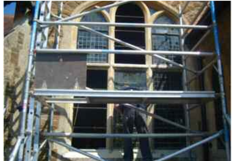
The windows being removed by a team from Sheppard Glass, hopefully they will be restored and refitted by the end of May.

Firstly we would very much like to thank all those people who donated books and cakes or helped at our sale on 13th March. I am delighted to tell you that it was a very successful event – our best yet. From memory the final net total came to around £850 (very useful, for as you can see from the photo, we have now started on the Window restoration project and the final bill for that is likely to be around £3,000!).